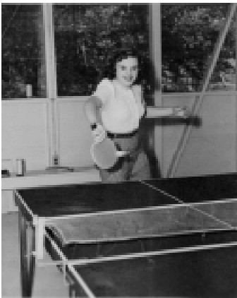
Last issue's celebrity: Judy Garland

Although we do not include a complete ratings list in this issue, we do give you a teaser of the current standings: