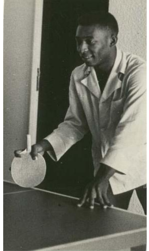
Don't touch the table!

Do you recognize this famous sports figure?